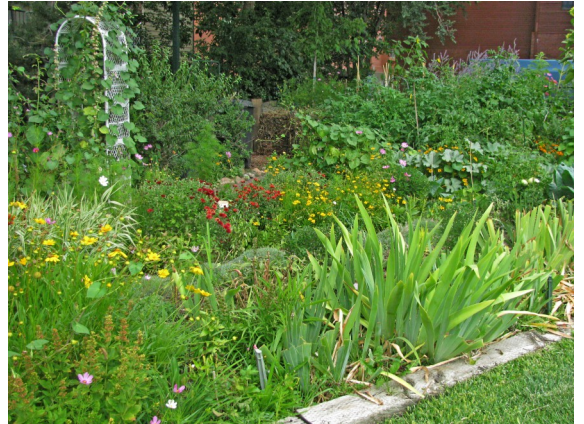
Glen Willow and Canyon Pointe Gardens